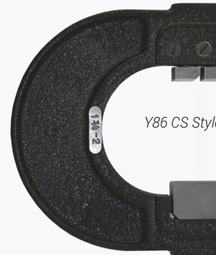
Y86 CS Style Anvil