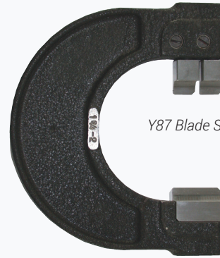
Y87 Blade Style Anvil